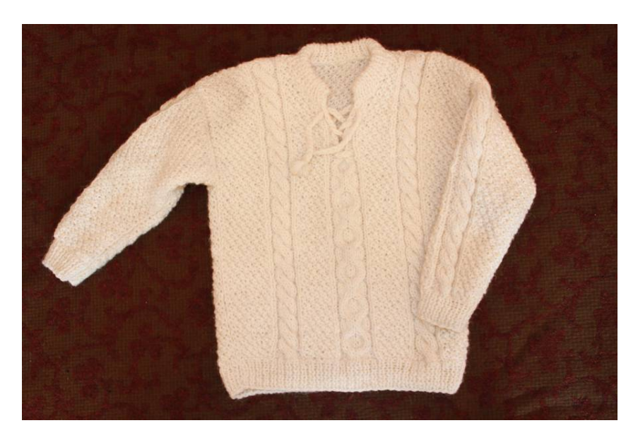
Il. 4. Woollen sweaters.

Knitting, that is plecenie as researchers dealing with folk crafts notice, was not traditional handicraft of Podhale<sup>11</sup>. This skill became common among women of Podhale only in the first half of the 20<sup>th</sup> century. Promoted in the 1920's it soon became important. The new less labour-consuming technique than weaving opened a possibility to produce woollen sweaters, caps, gloves and socks faster and on a bigger scale. This kind of knitted regional products were mainly intended for sale to tourists who visited the Tatras. The folks from lowlands willingly acquired highlanders' sweaters in natural light, grey and black colours. Geometrical patterns appeared on sweaters, socks and gloves to increase their aesthetic values. It is worth noting that woollen sweaters, socks and gloves were also appreciated by highlanders. They were introduced to highlanders' outfits and accepted as typical traditional elements of clothing. Thus, the knitting technique applied in Podhale for almost 100 years may today be considered a traditional handicraft.