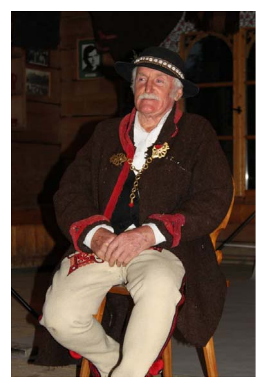
Il. 2. Cucha.

In addition to men's cuchas they were also similar women's guńkas , also called cuzecki which had a similar fashion. And though modern highlander women do not remember this kind of coats, in the 19<sup>th</sup> century descriptions we can find mentions about women's cloth guńkas .