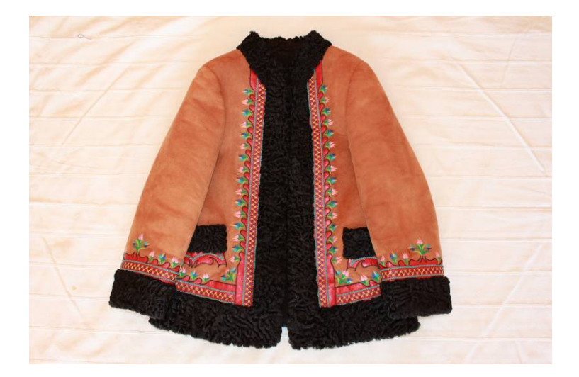
Il. 6. The Women's Fur coat.

Nowadays in Podhale there are a few dozens of furriers, most of them in Nowy Targ. Here we can also find the workshop run by spouses Pawlikowski-Blochorz, who several years ago decided to bring back to life the abandoned in the 19<sup>th</sup> c. "białczańskie" fur coats. On the basis of objects exhibited in museums they recreated in details the fashion and ornaments of the white fur coats, which soon became appreciated by the regional avant-garde of Podhale and among customers outside Podhale – mainly popular artists.