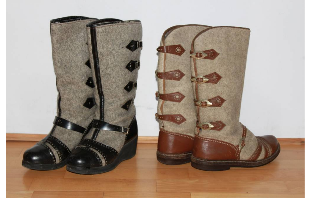
Il. 8. Winter cloth footwear, the so-called "kapce".

political freedom<sup>*</sup> they founded in Zakopane – a small village in Podhale at the foot of the Tatras, a centre of |Polish cultural and artistic life. What is important, in desire to emphasise the fondness for the local people the Polish artists and social activists started introducing certain elements of highlanders' outfit to their clothing. At the turn of the 20<sup>th</sup> century the seasonal fashion for men and women visiting Zakopane was dressing in highlanders' style. The most popular were jerkins decorated with colourful embroideries and red applications worn both by women and men. Tourist guidebooks even informed where highlanders' items of clothing and regional accessories could be bought.