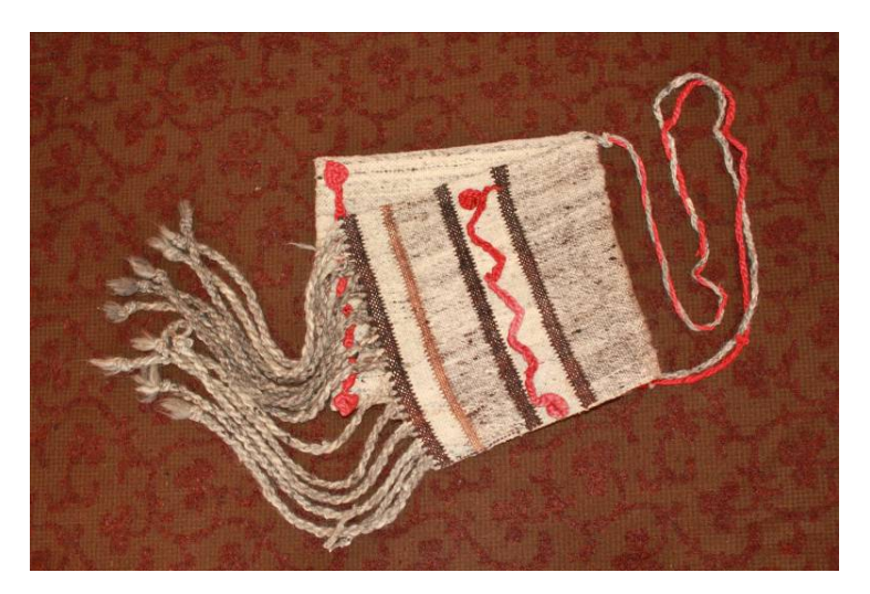
Il. 3. Shepherds' bag.

Mousy-white striped cloth was also woven from sheep wool. They were used to make big shepherd's bags (100 cm X 80 cm) also called juhases' bags. The flops of these bags were finished with characteristic long fringes. Juhases who pastured sheep on pasture lands. They were worn on backs, by throwing the so-called frabije, i.e. long straps attached to the sides of the bags on shoulders. The shepherds' bags were mainly used for carrying cheeses during pasture in huts. Also handy objects were kept in them: knives, shoemaker's tools, pipes, tobacco and money. Moreover, during heavy rains they were a good protection from rain thank to their fringes and folded in a rectangle they were used as pillows when juhases were resting. This type of bags disappeared at the end of the 19<sup>th</sup> century. They were brought back to life in the 1980's as an accessory worn by some highlanders with the outfit of Podhale.