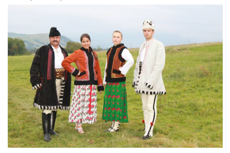
Il. 5. Fur coat from Podhale.

The second type of fur and leather coats were white fur coats with long sleeves. They were mainly bought by wealthy farmers. The fur coats were longer than jerkins and they reached at least mid-thighs. They were made of white-tanned leather by means of leaven composed of rye or barley flour mixed with water with addition of salt. Along their edges they were bordered with a narrow long-haired light or black trimming or sometimes with a black and white trimming of goat leather. According to Kamiński, at the front they were decorated with geometrical sapphire-red embroideries. In the 19<sup>th</sup> century this kind of fur coats were called bialcańskie . This name, as may be supposed, comes from the town in which they were produced. The most famous production centre of white fur coats made to the "Hungarian design" in the second half of the 19th century was Białka (nowadays Białka Tatrzańska). The knowledge of this trade is believed to have been brought by a local farmer, who completed apprenticeship in Budapest<sup>23</sup>.